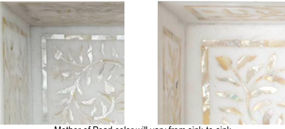
Mother of Pearl color will vary from sink-to-sink