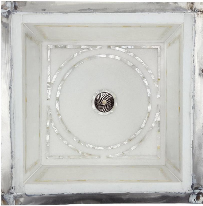
Shown with D013 PS-SCR02-N drain